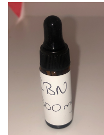
Cannabinoids (% weight)